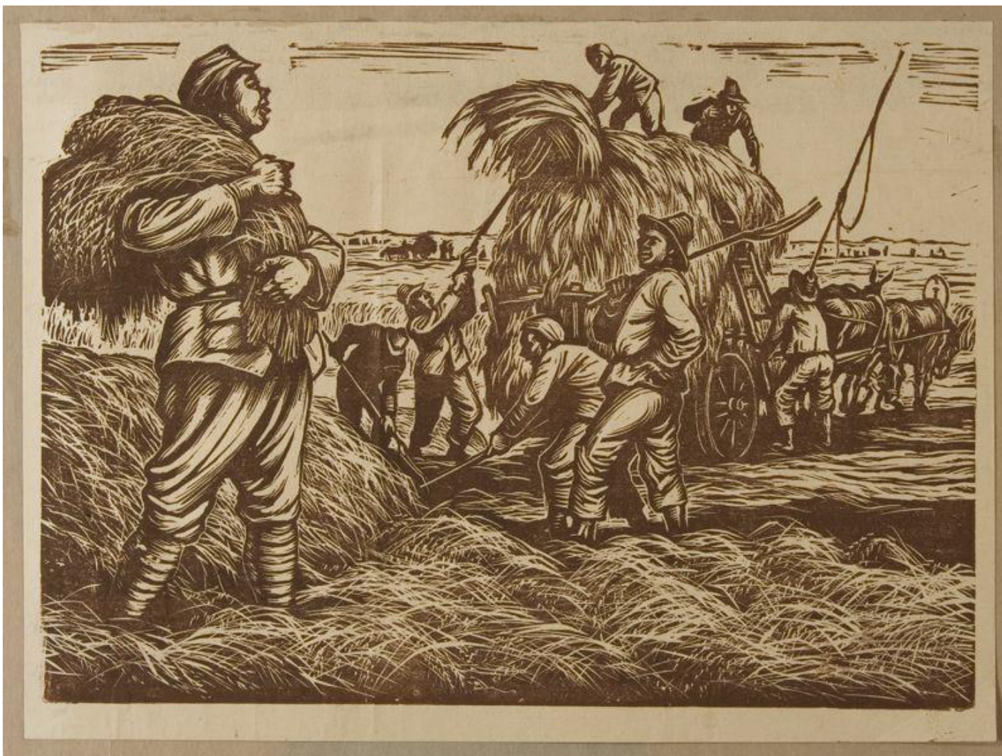
12.8a: "Soldiers and People Working Together"